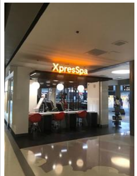
Airport terminal's Center Core